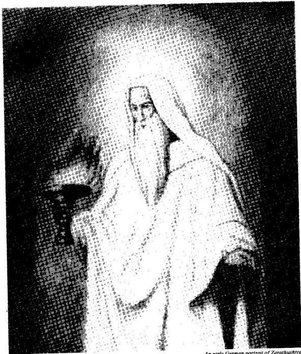
An early German portrait of Zarathushtra

(Yr.13.103, SBE Vol.23 p 107), is deemed to be the popularly known wife of the prophet. It is stated in the tradition that three posthumous sons will be conceived from the seed of Zarathushtra and Hvōvī, but will be borne by three virgins at thousand year intervals 3 . They will be called Ukhshyat.ereta ( Ph.Ushēdar - "he who makes righteousness grow"), Ukhshyat.nemah ( Ph.Ushēdarmah - "he who makes reverence grow") and Astvat.ereta ("he who embodies righteousness"), the Saoshyant. ( In.Bd.32.8, SBE Vol.5 p 144).