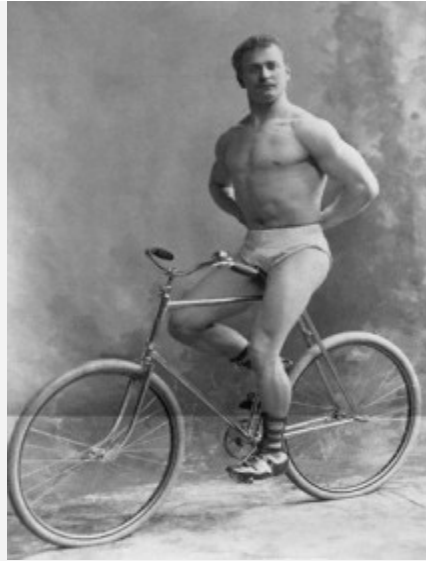
Eugene Sandow's visit to India in 1904 inspired generations of Indian bodybuilders