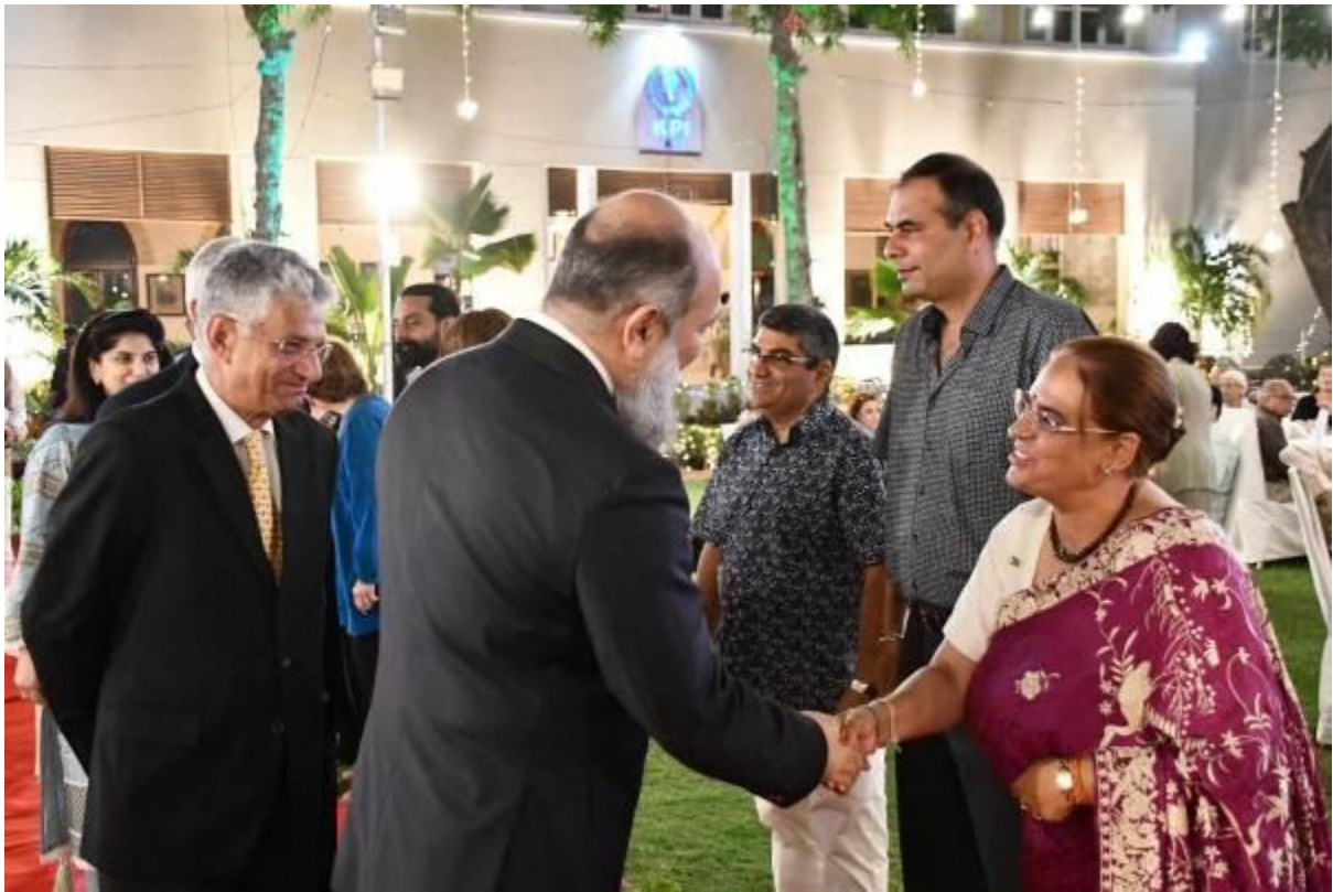
The presence of the Honorable Chief Guest Jam Kamal Khan, Federal Minister of Commerce, added distinction to the occasion.