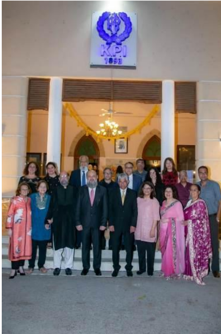
Group Photo: Chief Guest flanked by KPI President, Members of the Managing Committee & recipients of High Achiever Awards.