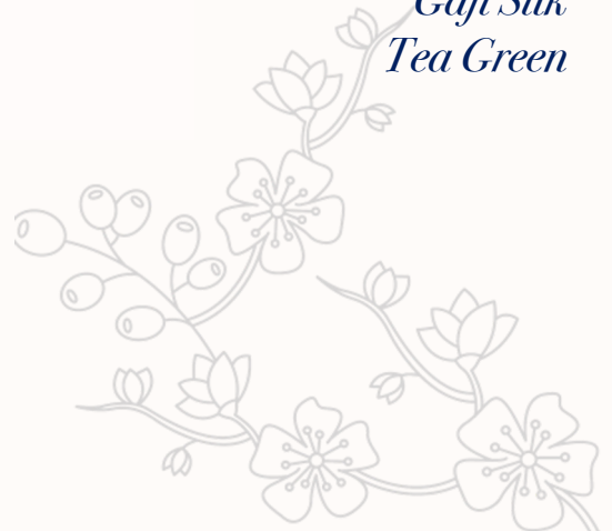
Gaji Silk Tea Green