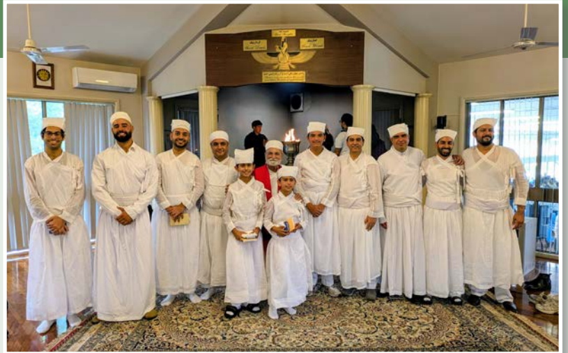
Annual Jashan Mobeds lined up in front of Atash Kebla

The prayers were deeply appreciated by all in attendance. The clarity of the ceremony was further enhanced by a professional audio setup, generously provided and managed by a community member, ensuring every word of our ancient prayers was heard clearly across the congregation. Many attendees were pleasantly surprised to learn that the sound had been amplified - a testament to how seamlessly it had been arranged.