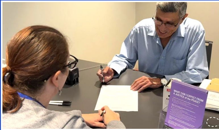
On JP Duty